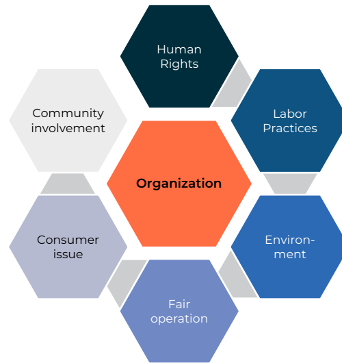
Eviden's Business Responsibility and Sustainability Reporting (BRSR) Framework

Eviden's BRSR Solution is an add-on to SAP Sustainability Control Tower (SCT). Accessed through SCT it offers detailed and comprehensive insights into a company's environmental, social, and governance (ESG) performance. It is designed to assist companies to effortlessly prepare their Business Responsibility and Sustainability Reports in compliance with regulations. The platform's comprehensive features also allows organizations to assess their impact and pinpoint areas for improvement. Here's a summary of its capabilities: